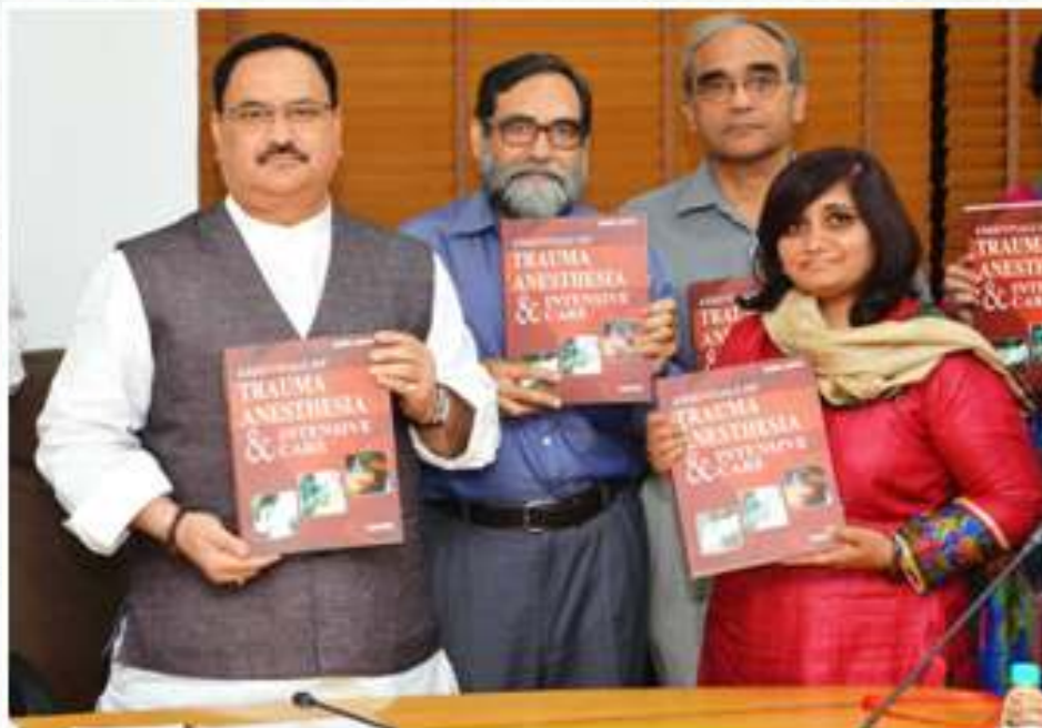
Photo of Book Release by Honourable Cabinet minister Sh. J P Nadda , Health and family welfare